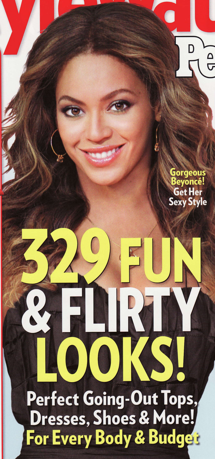
Gorgeous Beyoncé! Get Her Sexy Style